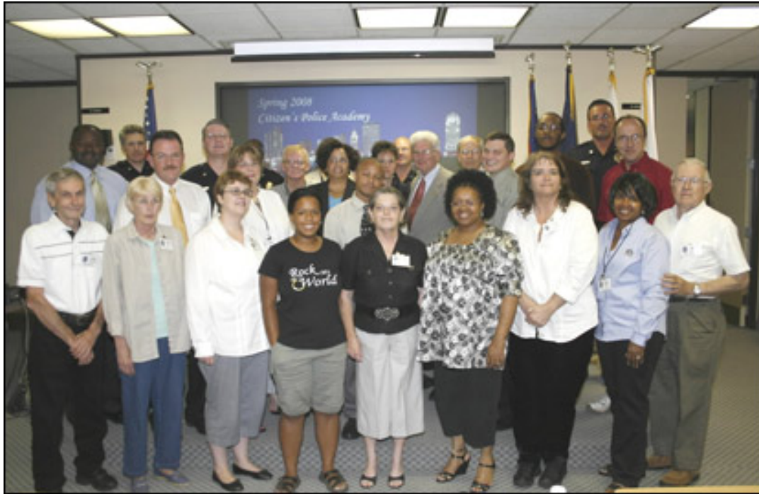
Graduates of WSPD Citizens Police Academy